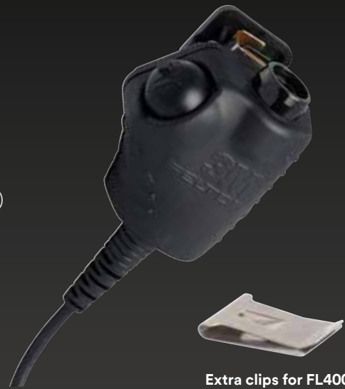
Extra clips for FL4000