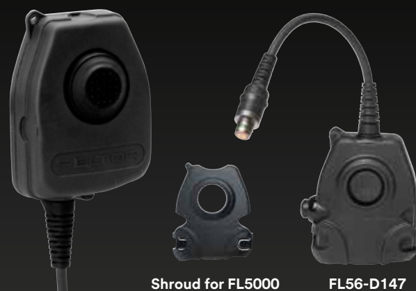
Shroud for FL5000